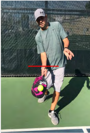
Figure 4-1 (legal serve)