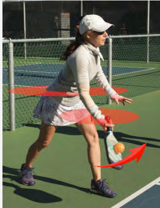
Figure 4-3 (legal serve)